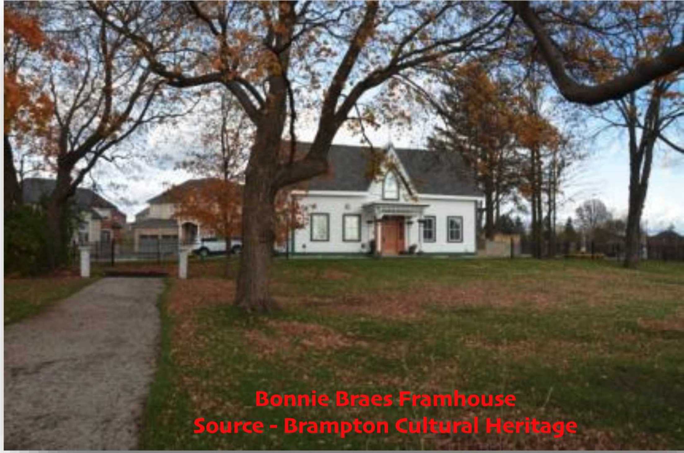
Bonnie Braes Framhouse