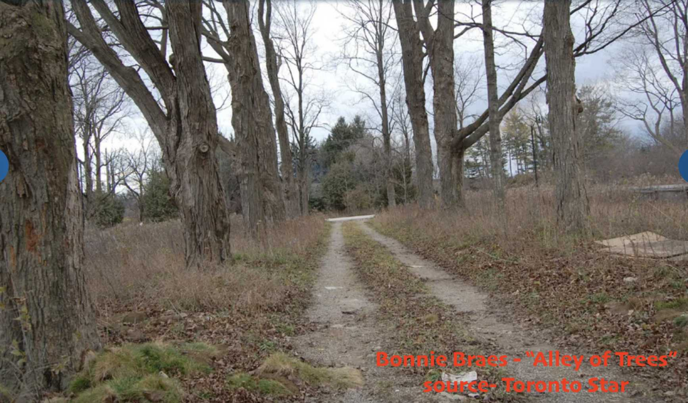
Bonnie Braes - "Alley of Trees"