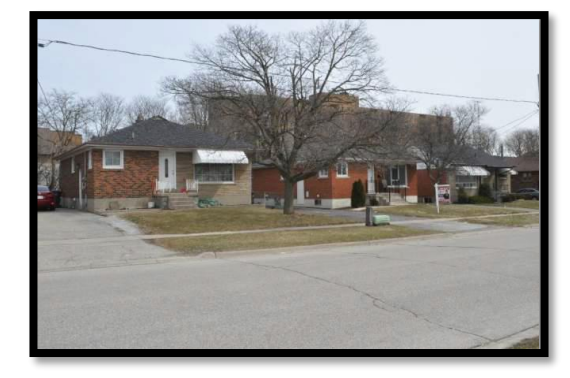
East side of Trueman Street between Eastern Avenue and the CNR corridor