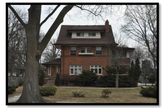
40 Mill Street North