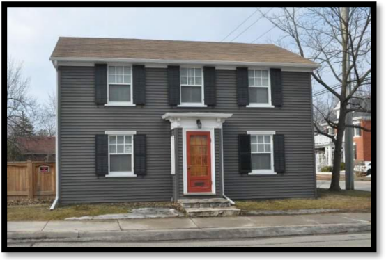
19 Isabella Street