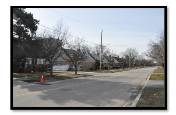
McCaul Street between Kennedy Road North and Sophia Street