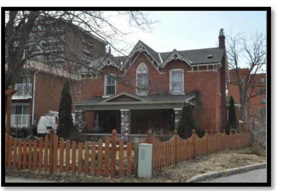
15 Scott Street