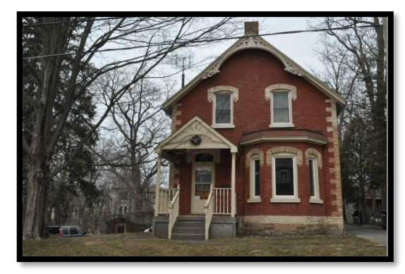
12 Joseph Street