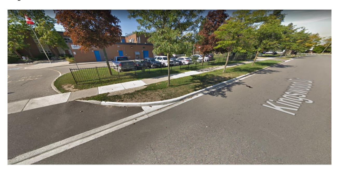
View in front of Kingswood Public School