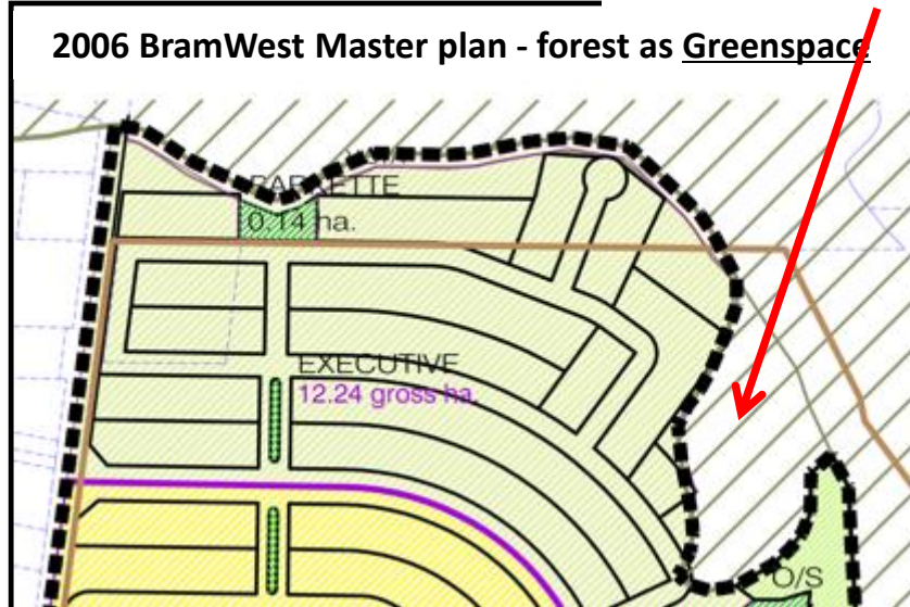
2006 BramWest Master plan - forest as Greenspace