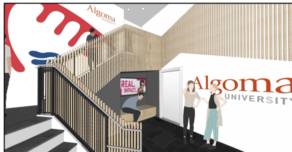
Ground Flr: Entrance Lobby