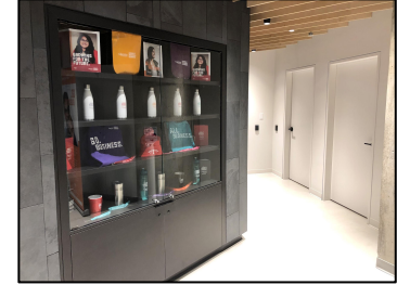
Lower Lobby: SBE Full-time Faculty Offices