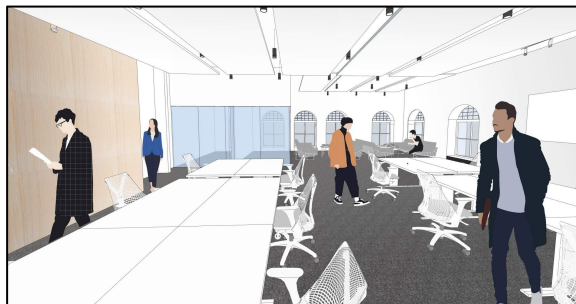
2 nd Flr: Student Centre