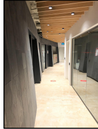
Lower Lobby: School of Business & Economics