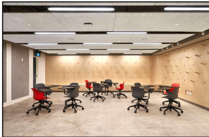
Lower Lobby: Classroom