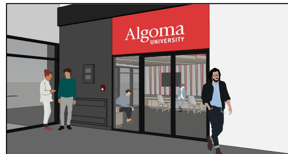
Ground Floor: Welcome Centre