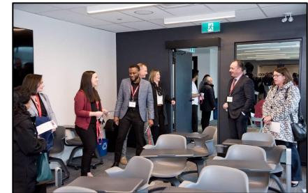
3rd Floor: School of Computer Science & Technology – Classroom