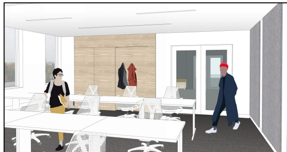
3 rd Floor: The School of Computer Science & Technology - Classroom