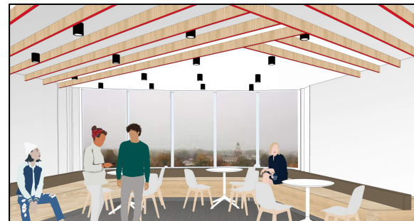
6 th Floor: Lounge