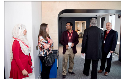
3rd Floor: School of Computer Science & Technology – Student Lounge