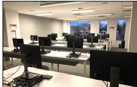
3rd Floor: School of Computer Science & Technology – Computer Lab