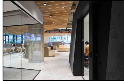
Lower Lobby: School of Business & Economics