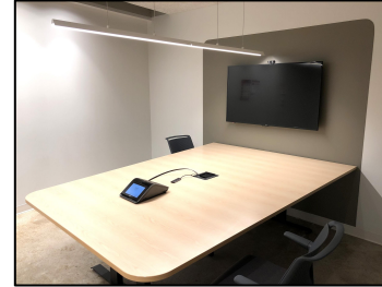
Lower Lobby: Student Meeting Room