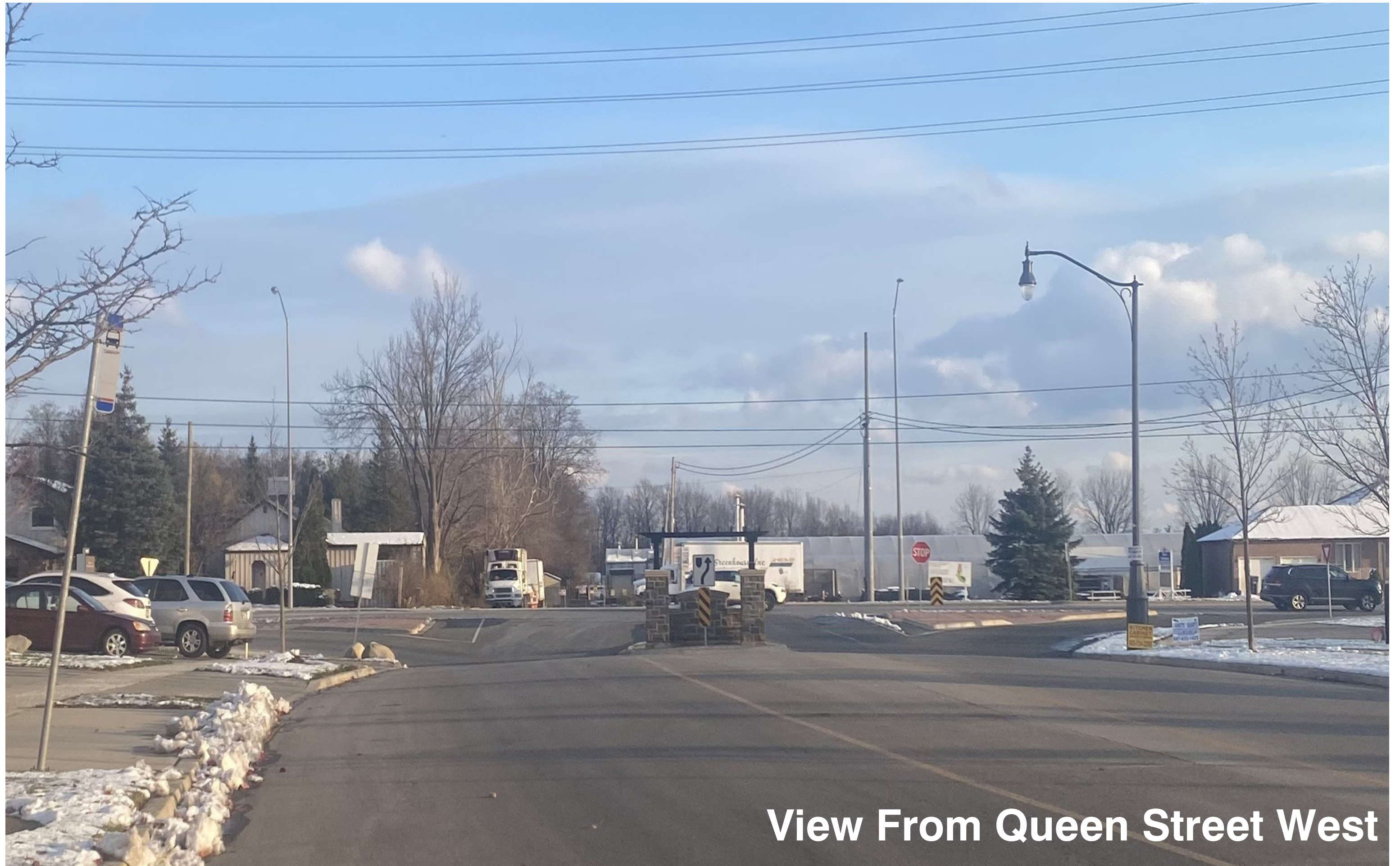
View From Queen Street West