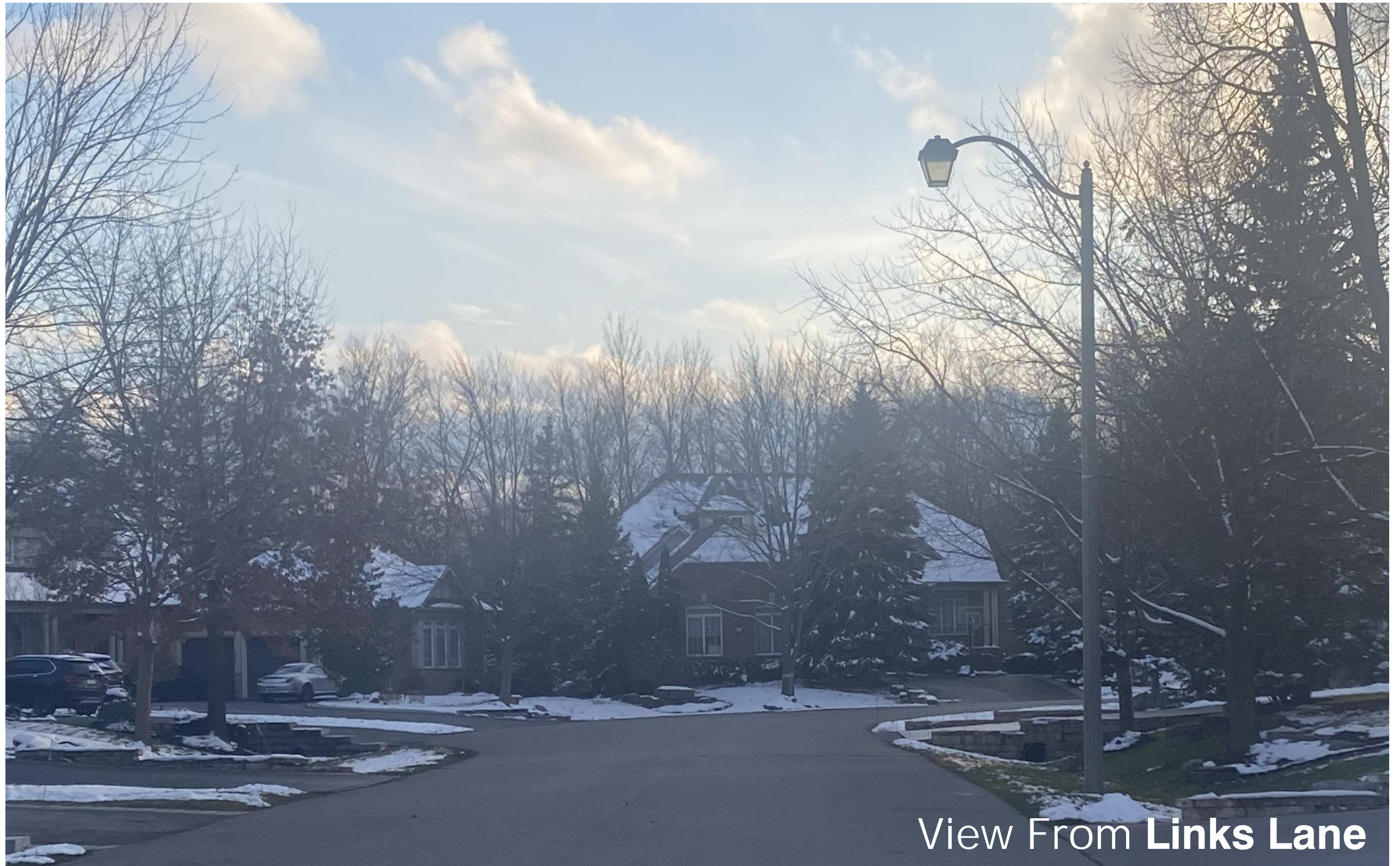
View From Links Lane