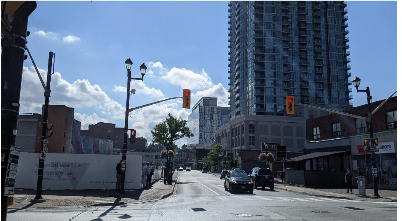
Existing site condition: view from Nelson St. W. through George St. N