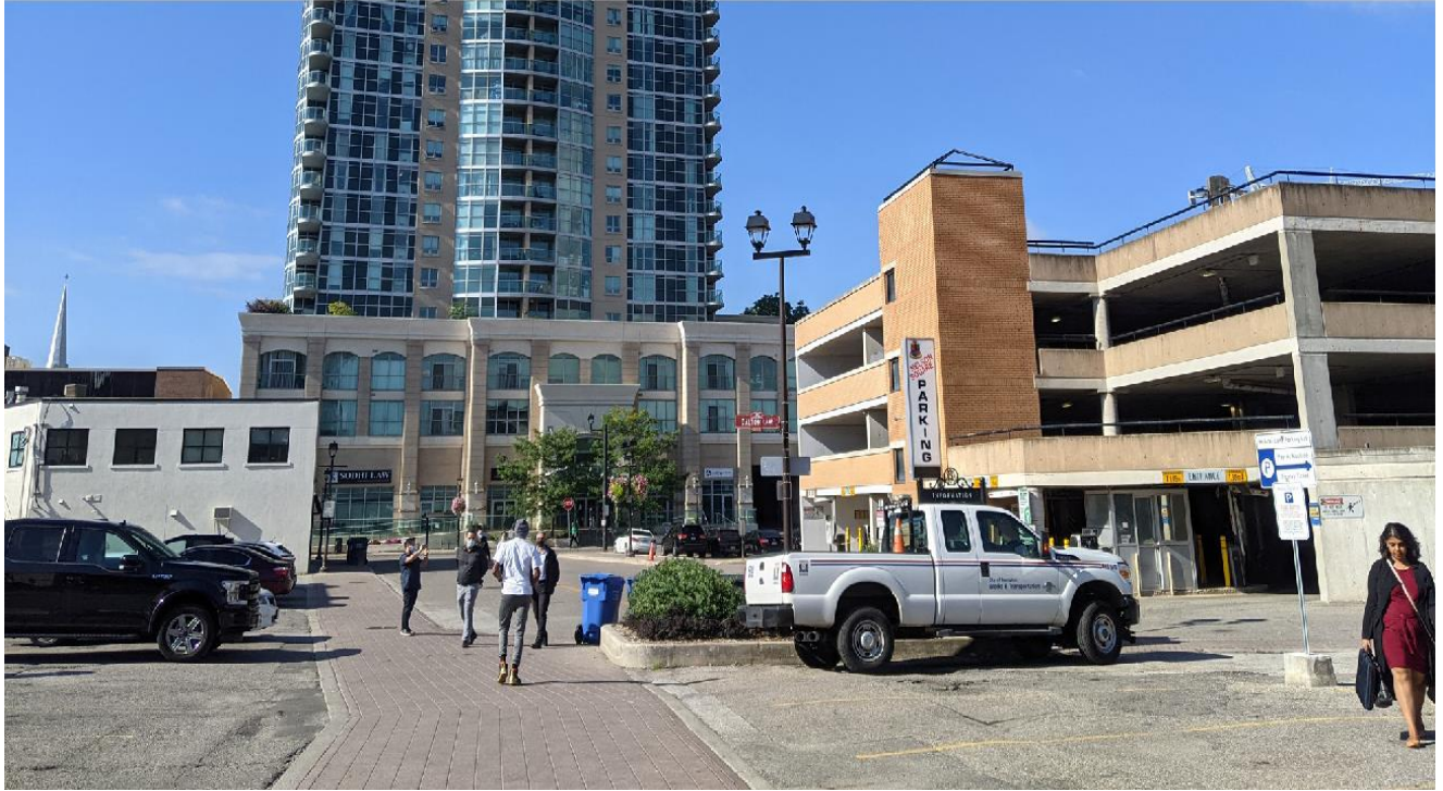
Existing site condition: view through Diplock lane toward George St. showing the existing parking garage