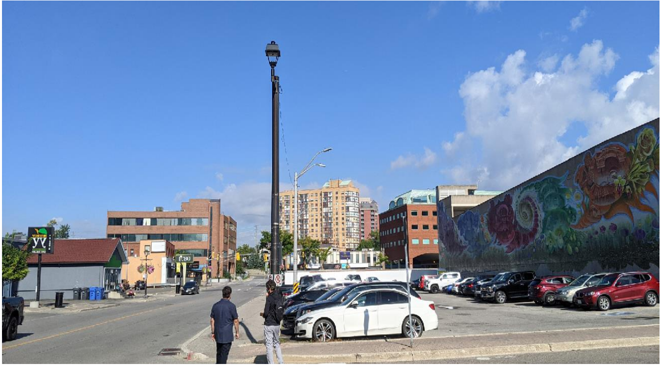
Existing site condition: view from George St. N. and Diplock Lane