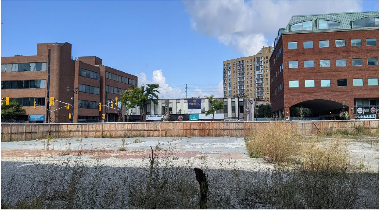
The existing site previously had a commercial building at 21 Nelson which was demolished in 2019 leaving only the foundations and slab on grade.