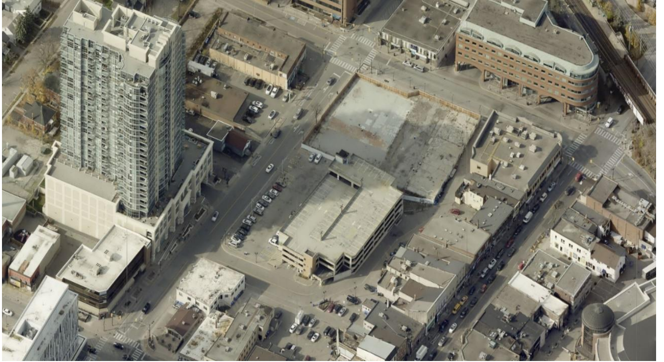
Existing Site condition: aerial view