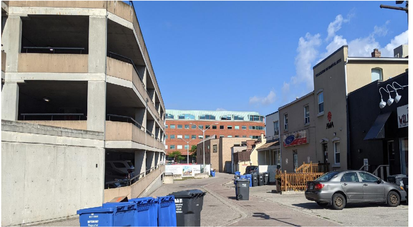
Existing site condition: view through Diplock lane toward Nelson St. showing the existing parking garage to the west.