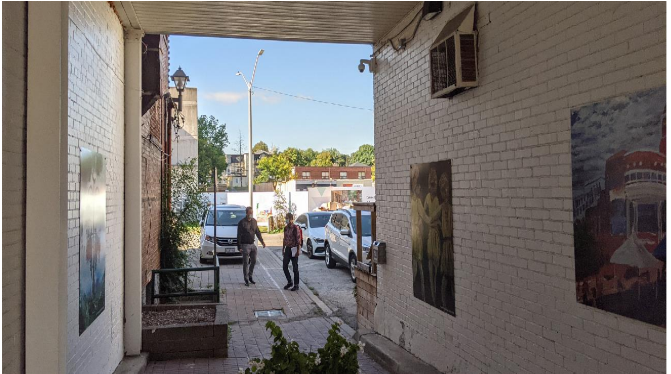
Existing site condition: view from Diplock Lane showing the existing connection through an opening under the shops from Main Street