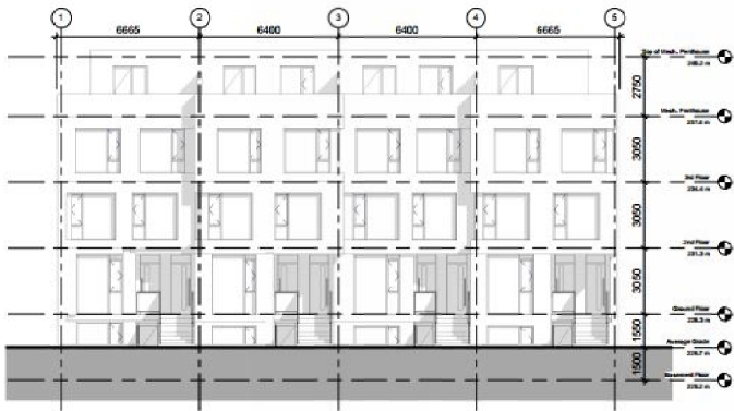
① South Elevation - Block A 1 : 100