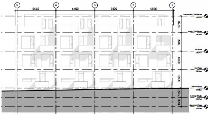
③ North Elevation - Block A 1 : 100