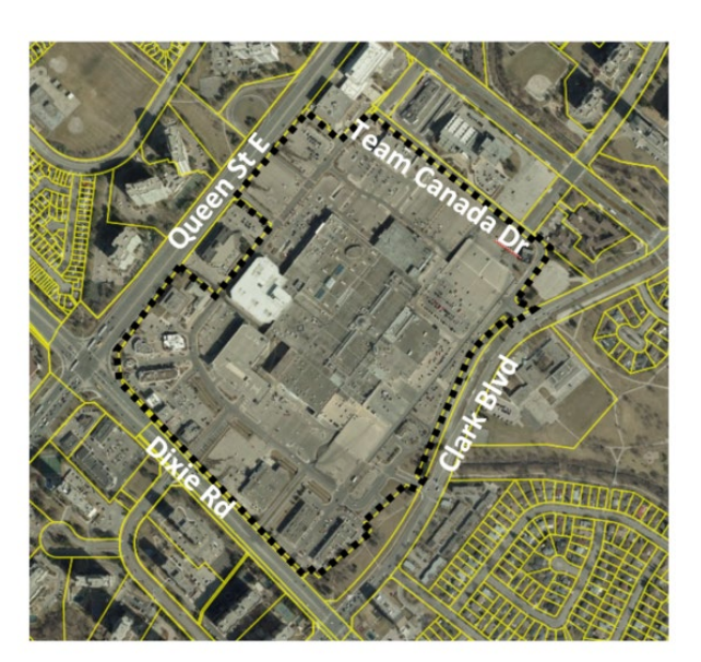
Bramalea City Centre

MacNaughton Hermsen Britton Clarkson Planning Limited ("MHBC") is retained by Morguard Corporation ("Morguard") with respect to the Bramalea City Centre ("BCC") located at 25 Peel Centre Drive (outlined on the location map below). BCC is a successful regional shopping centre containing approximately 1.5M square feet of retail and office space on 33 hectares of land. It is a major activity centre, drawing people from around the city and region to shop, work and play. Over the years, the ownership has made substantial investments into the property to maintain the regionally significant class A shopping centre status that it enjoys today.