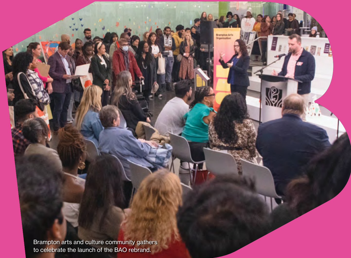
Brampton arts and culture community gathers to celebrate the launch of the BAO rebrand.