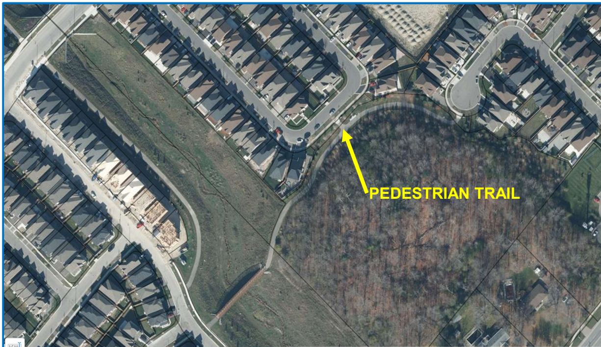
AERIAL PHOTO OF PEDESTRIAN TRAIL