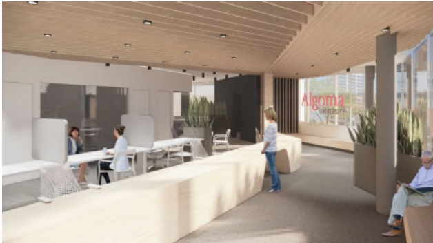
Ground reception area