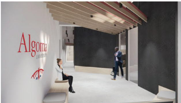
Second floor waiting area