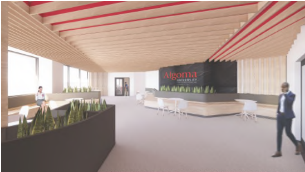
Main Entrance & Student Lounge