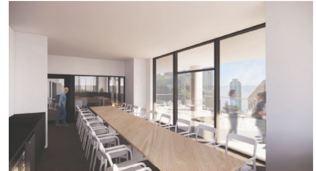
Workshop & Event Space