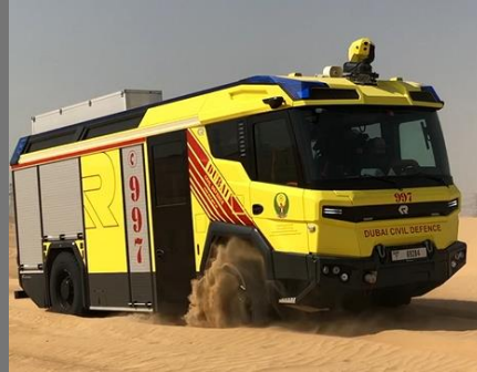
Hot Ambient Temperature Test