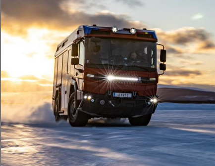
Cold Temperature / Friction Test