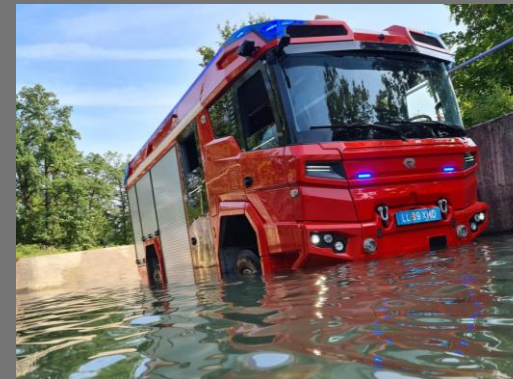
Fording / Wading Testing