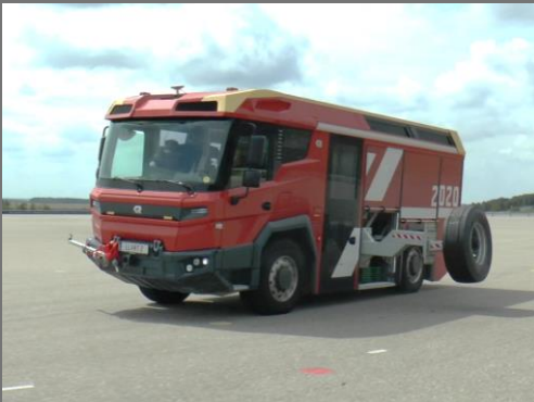
Driving And Handling Test