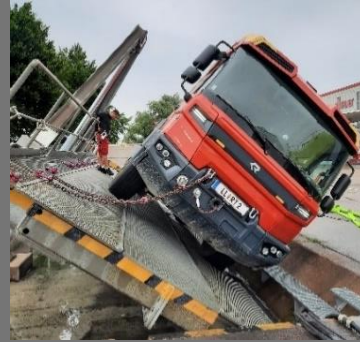
Stability / Tilt Table Test