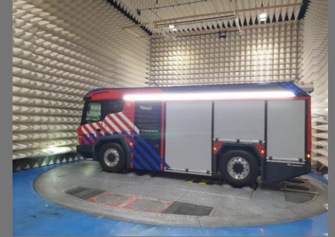
Electromagnetic Interference Test