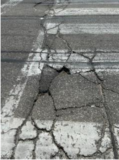
Examples of cracks and holes that are tripping hazards