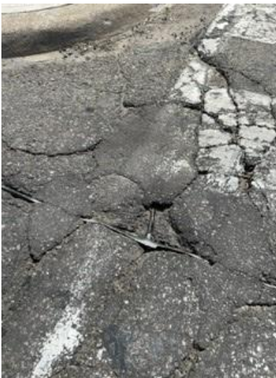
Same as above