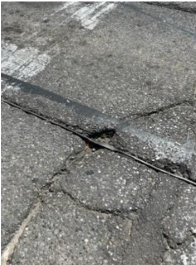
Asphalt is breaking away from the cables under it