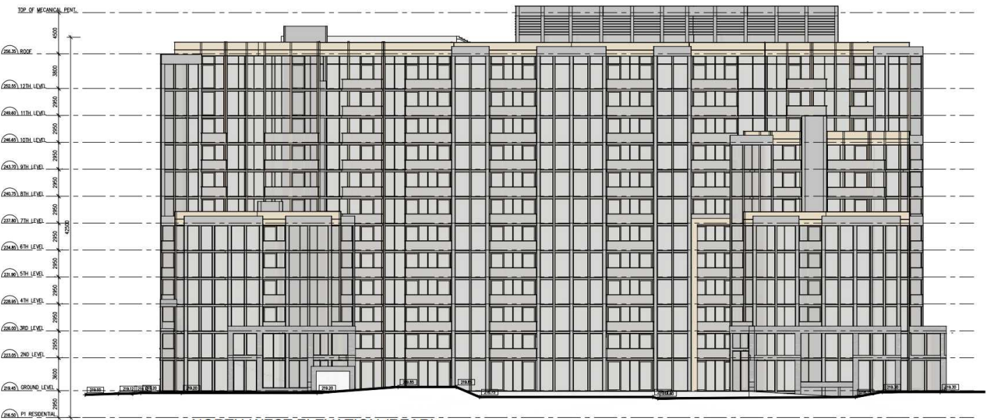
NORTH-WEST ELEVATION (REAR)