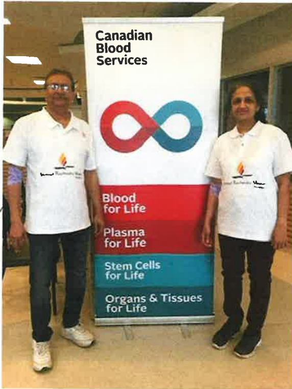
Canadian Blood Services