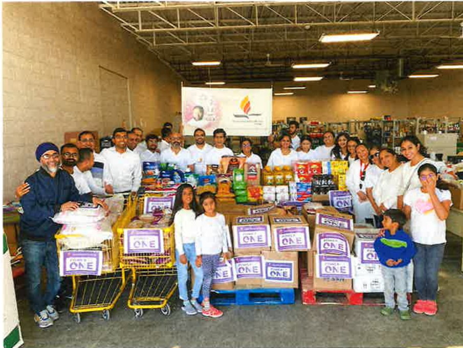
Donations to Food Bank