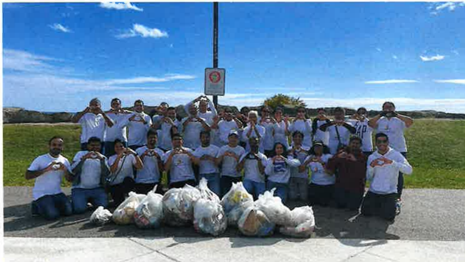
Adopt a Park - Partnering with the City of Mississauga to adopt Lakefront Promenade