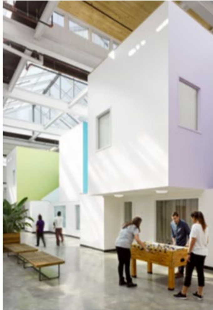
Eva's Place Toronto