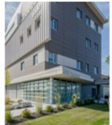
Belinda's Place Newmarket