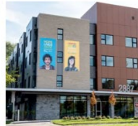
Youth Services Bureau of Ottawa