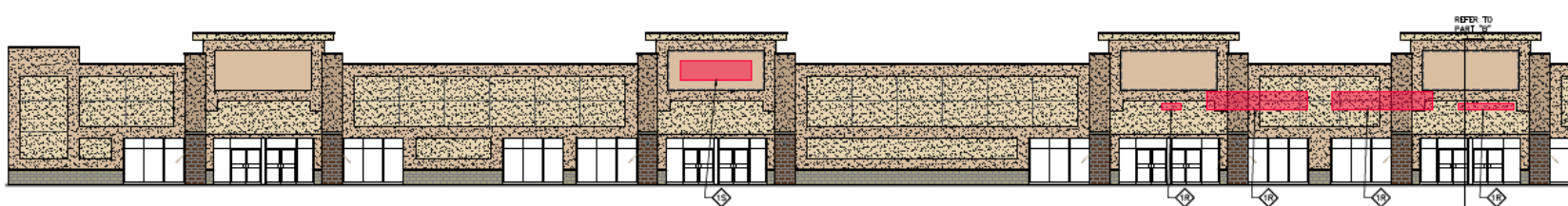
1 EXISTING SOUTHWEST ELEVATION PART A SCALE: 3/32"=1'-0"

Signs Installed With Permits Identified By Red Boxes