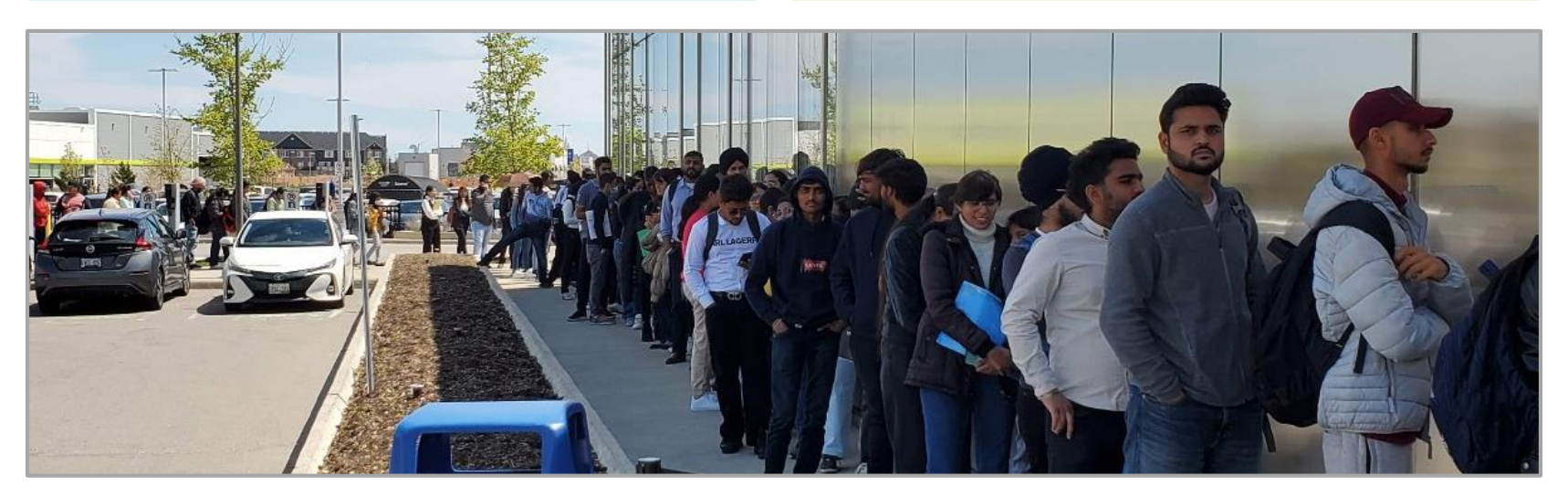
Both the Youth Job Fair at Springdale (above) & MakerFest at Chinguacousy had 1000+ participants.

2023: 73329 Attendees Across 3852 Programs (approx. 19/program)