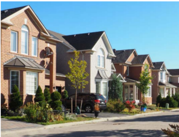
Example of Community Window Street