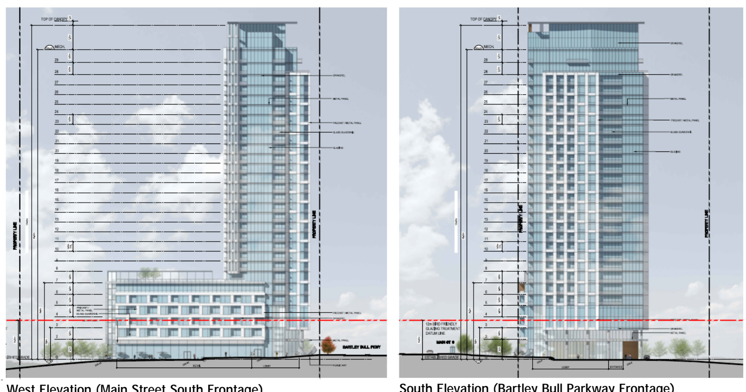
West Elevation (Main Street South Frontage)